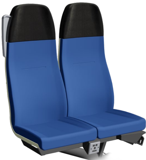
Vario Relax 3000