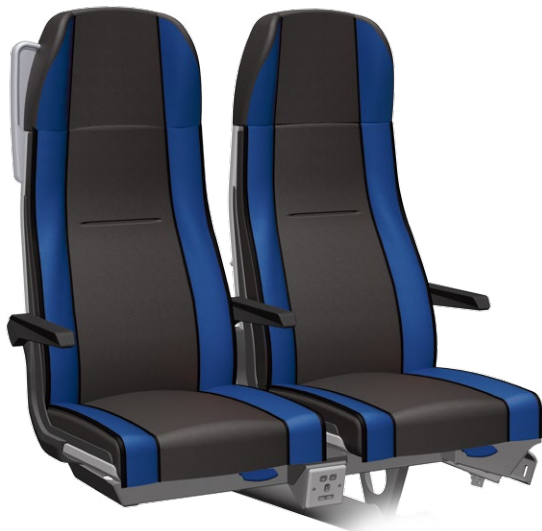
Vario Relax 3000R

The VARIO RELAX 3000 seat has been specially developed for daily use in commuter trains and regional trains. The seat consists of a self-supporting and robust aluminum structure and is highly crash-safe and fire-proof.