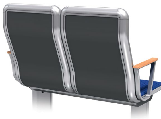
Vario Relax 1000®