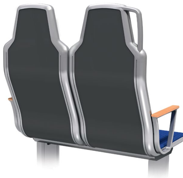
Vario Relax 2000®