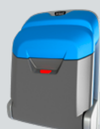
VERSO RUSH HOUR