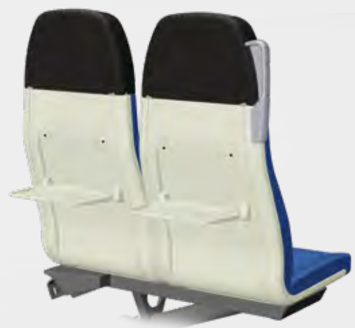
VARIO RELAX 3000 BACK