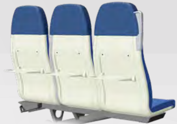
THREE SEAT COMBINATION BACK