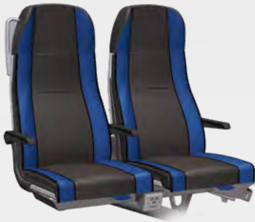
VARIO RELAX 3000 R