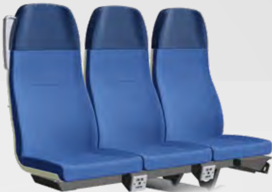
THREE SEAT COMBINATION